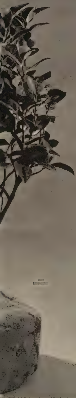
hed Camellia B&B